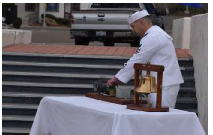
Tolling of the Boats Ceremony