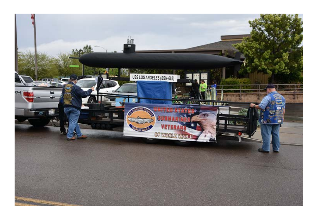
Preparing the Float for the Ramona Main Street Parade