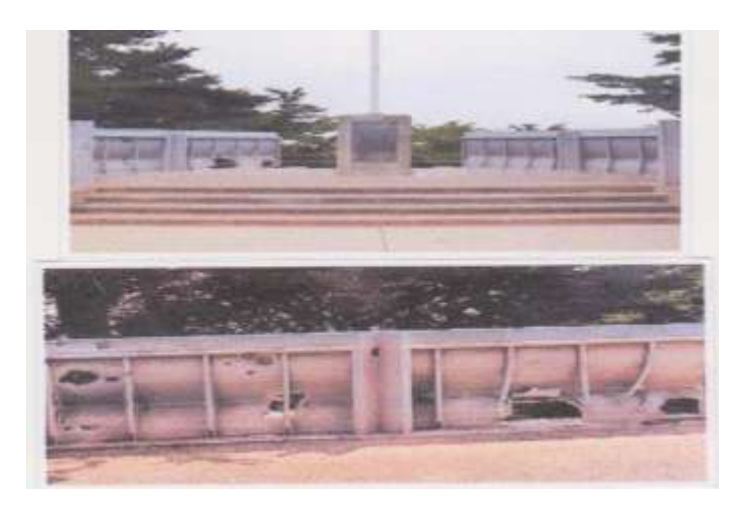
Two shots of the memorial. Note the shell damage in lower photo.

end of the war and scrapped finally in 1959. The memorial features the battle damaged bridge wings from the ship.