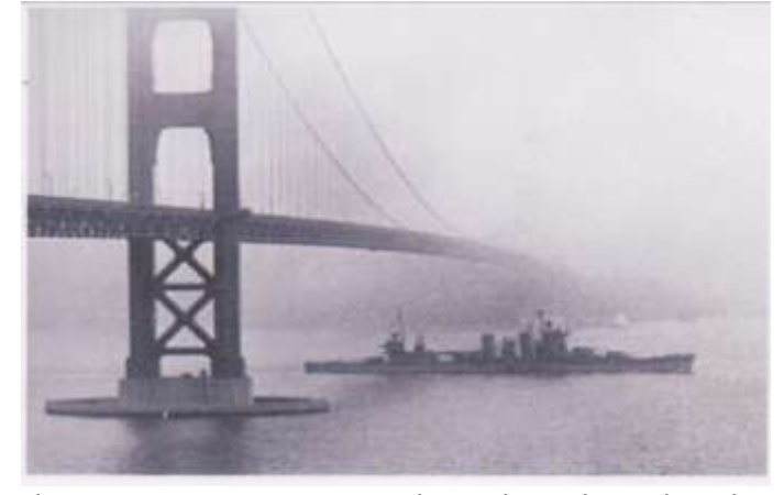
The USS San Francisco sails under what else the Golden Gate Bridge in 1942

My interest in Sutro's and the area was renewed and I broke out my 1967 copy of a map of San Francisco and while looking it over saw an area marked USS San Francisco Memorial. Wondering what the ship was I went on line and read up. The ship CA-38 was a cruiser of the New Orleans class that primarily served during WW 2 in the battle for Guadalcanal in 1942. The next words describe that journey into hell pretty fully.....during the battle the ship heavily damaged.....her was captain and admiral killed ..... earlier she mistakenly opened fire on the light cruiser Atlanta causing serious damage and inflicting numerous casualties. Well the ship built in 1934 earned 17 battle stars and other awards and she was decommissioned in 1945 at the