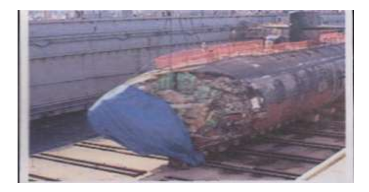
This same photo of the damaged sub in dry dock in Guam appeared in several sources. The tarped area was most likely secret equipment.

buoyancy and was sinking. In a desperate and frantic life or death struggle for survival heroic efforts by the crew enabled the boat to surface and she was escorted back to Guam by at least 3 other ships and several aircraft.