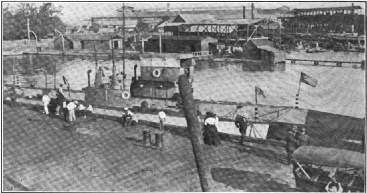
The Submarine Boats F-1 and F-3 Tied Up Alongside the Naval Dock in Honolulu. (1914)

The organization will engage in various projects and deeds that will bring about the perpetual remembrance of those shipmates who have given the supreme sacrifice. The organization will also endeavor to educate all third parties it comes in contact with about the services our submarine brothers performed and how their sacrifices made possible the freedom and lifestyle we enjoy today.