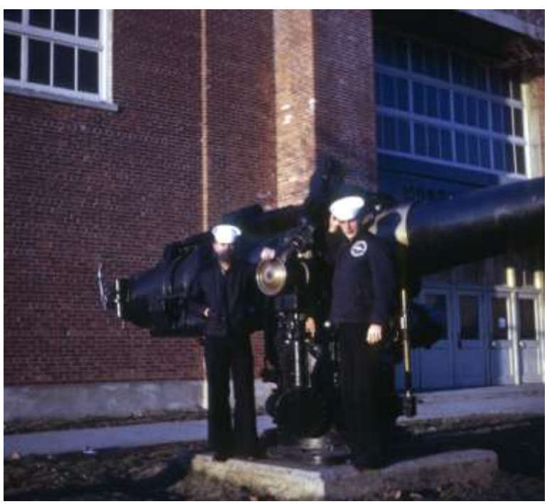
The big deck gun on the sub school grounds and my friends

pay. That proceeds the eventual love for the boats. Because subs are more dangerous than most surface ships the Navy offers extra pay called "hazardous duty pay" as an incentive to sail the boats.